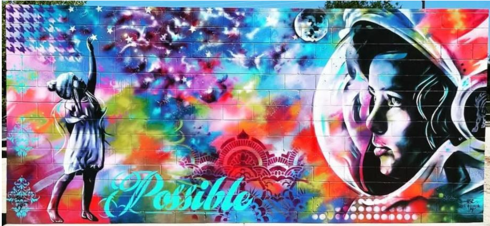
"Mission Possible" - Bryce Chisholm, 2019

Location - Empire Elementary School, south facing wall La Loma Drive and Gordonia Drive, Carson City, NV