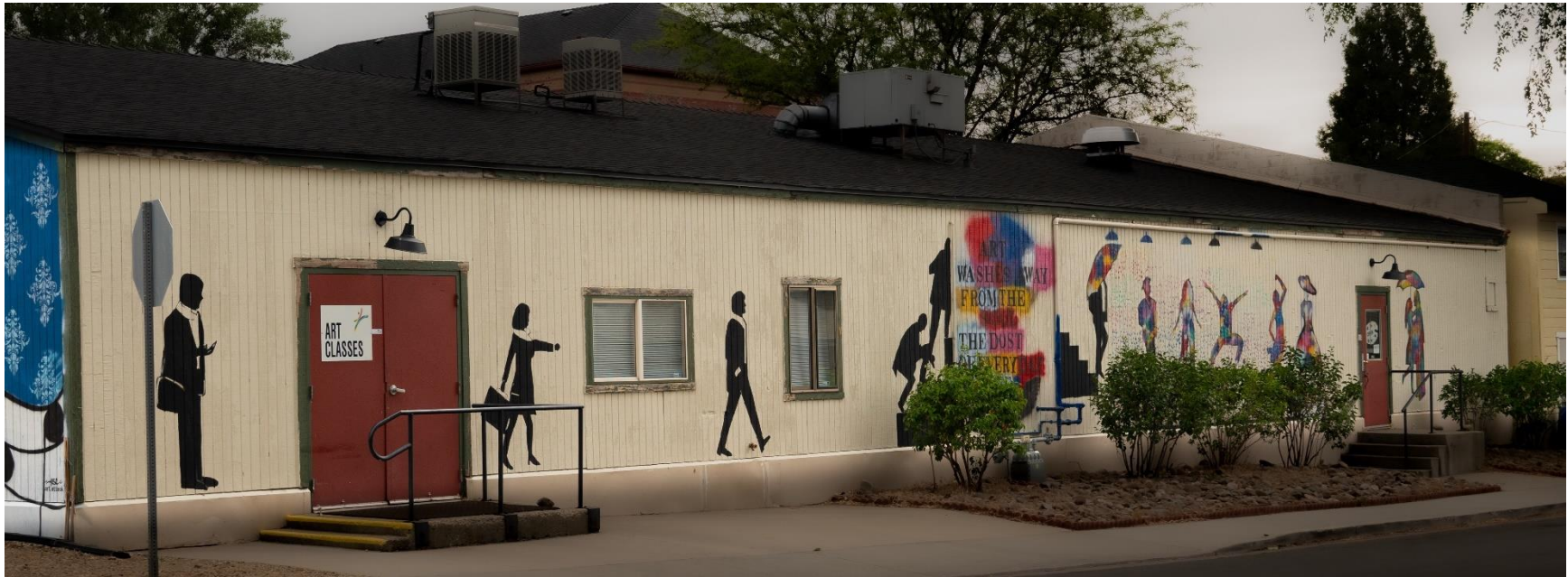
“Cleansing the Soul” - Diana Uzzell, 2020 Location: Second Street wall of the Brewery Arts Center

This Brewery Arts Center mural with a quote from Pablo Picasso, filled a request to create something “Banksy”.